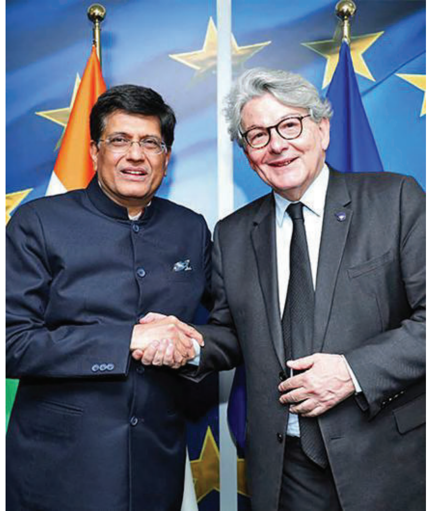
Union Minister Piyush Goyal with Thierry Breton, EU Commissioner for Internal Market, in Brussels.

While the move will likely impact less than 2% of India’s exports, the government is examining the extent to which the overall carbon tax and the differential tax treatment proposed for instance, for steel using different furnace technologies, is compatible with WTO (World Trade Organisation) norms, said another official. “The verification process could be very complex and tedious and mutual recognition agreements will be vital,” the second official noted.