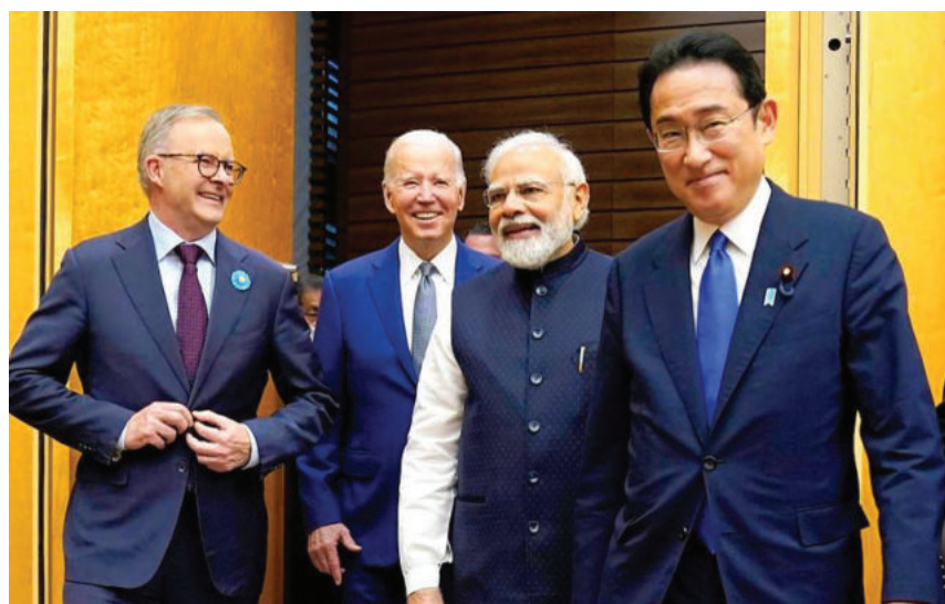
Four pillars: From left, Anthony Albanese, Joe Biden, Narendra Modi and Fumio Kishida at a summit in Tokyo in 2022. File Photo